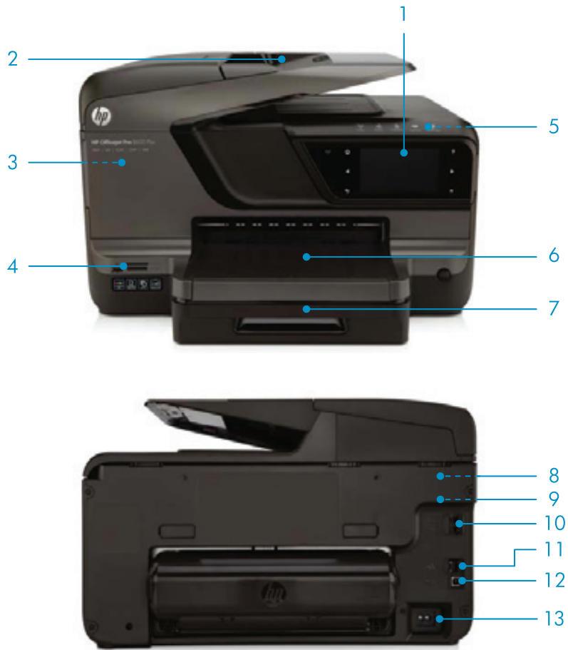
HP Officejet Pro 8600 Plus e-All-in-One shown