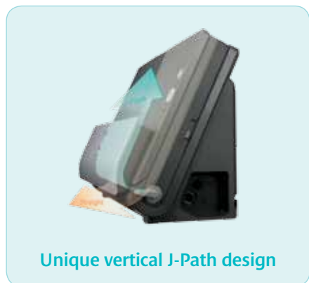
Unique vertical J-Path design

The vertical J-Path design allows documents to be fed and received vertically, so no extra desk space is required. Side-mounted cables and ports let you place both devices directly against a rear wall, or even on a shelf, for the ultimate in space-saving convenience.