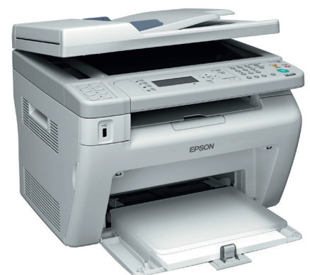
AL-MX14NF 1 model with print, copy, scan and fax functions